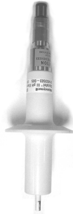
7794 Sanitary Durafet® III Electrode

The Cap Adapter cable option is essentially a preamplifier that is an integral part of the electrode cable. It does not require separate mounting. The output from the Cap Adapter can be connected directly to a pH instrument (9782 or APT2000). It is available in lengths of 20' and 50'.