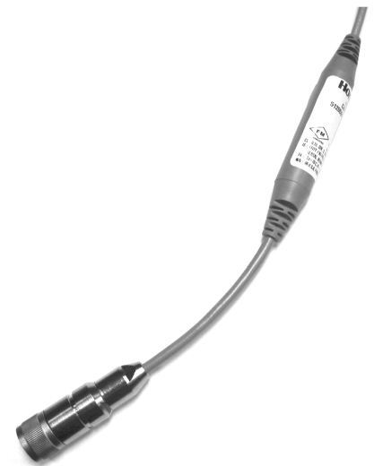
Optional Cap Adapter